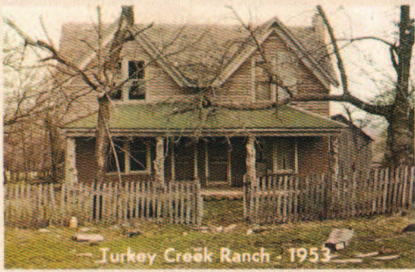
Turkey Creek Ranch - 1953